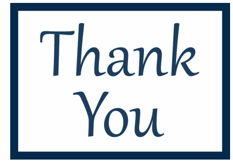
"Thank You" - Code S-TY